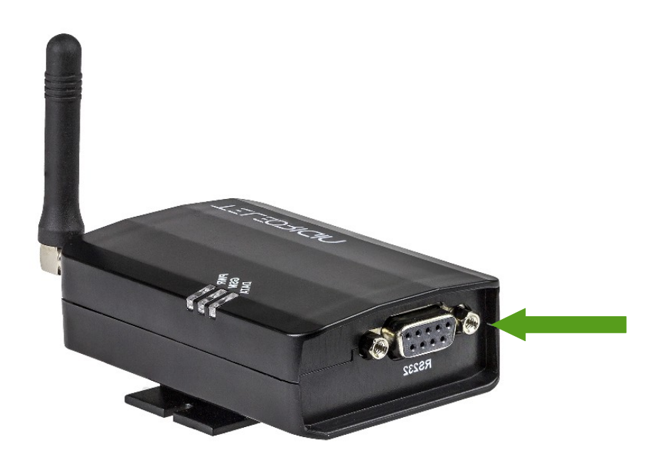
Table of RS-232 DB9 nins:

RB600-NB terminal is equipped with RS-232 interface (as shown below). DE9 DSUB socket is connected via voltage level translator circuit to the NB-IoT module.